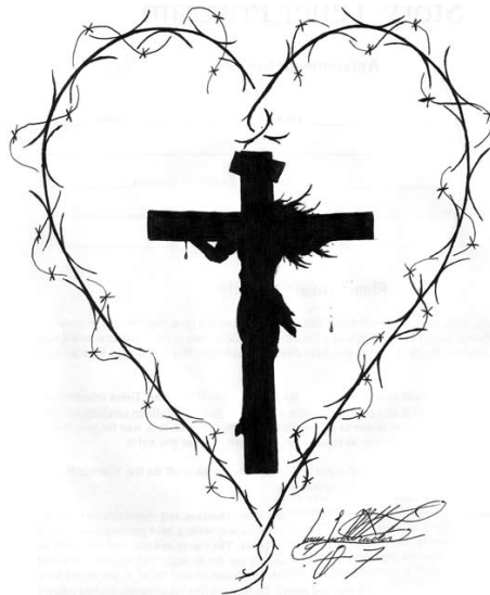
Corey Mitrucker FDCF '07